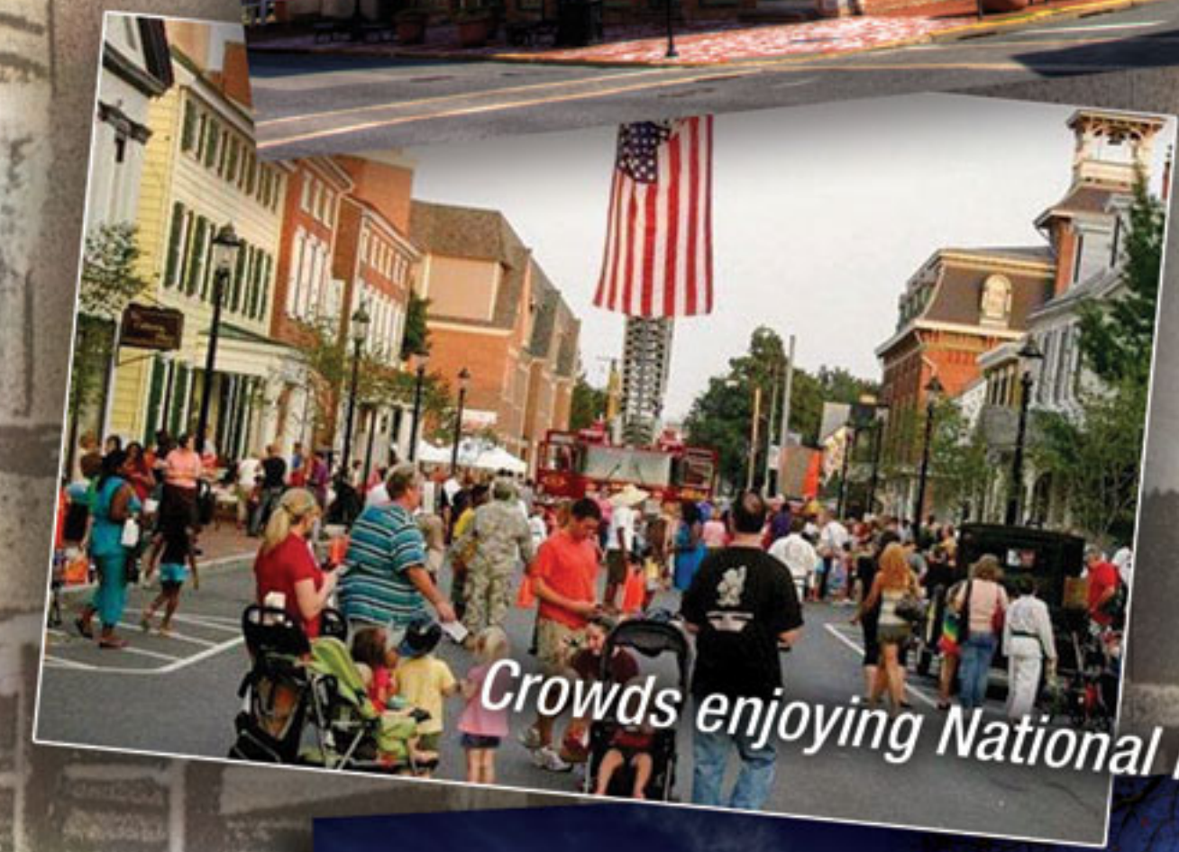
Crowds enjoying National Night Out