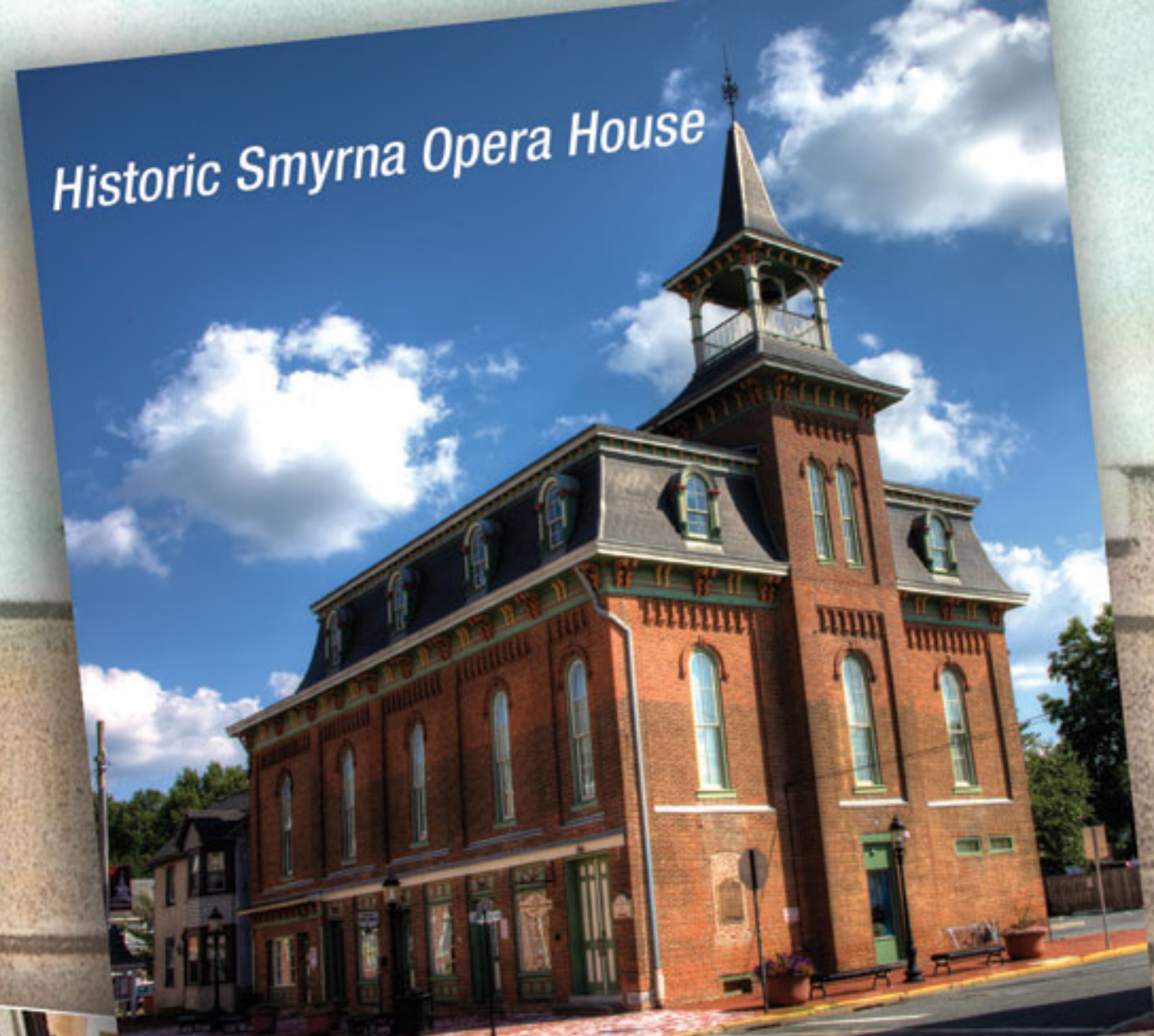
Historic Smyrna Opera House