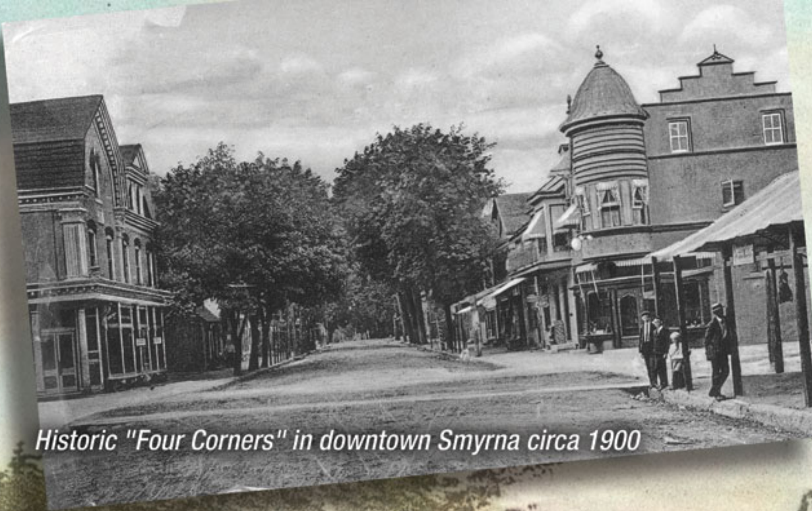
Historic "Four Corners" in downtown Smyrna circa 1900

The Smyrna Downtown Renaissance Association is dedicated to recruiting and retaining businesses as well as working with merchants in its historic business district to assure their success in this ever changing and challenging economy. If you love history and quaint historic downtowns, we invite you to join us to work on strengthening the economic and cultural vitality of historic downtown Smyrna while enhancing and preserving its historic character.